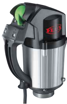
F 460 Ex (HT)

Both our motor F 460 Ex (HT), as well as our 400 series explosion proof (HT) stainless steel pumps are certified by the National Metrology Institute (PTB) for applications in hazardous areas with higher ambient temperature of up to 60 °C.